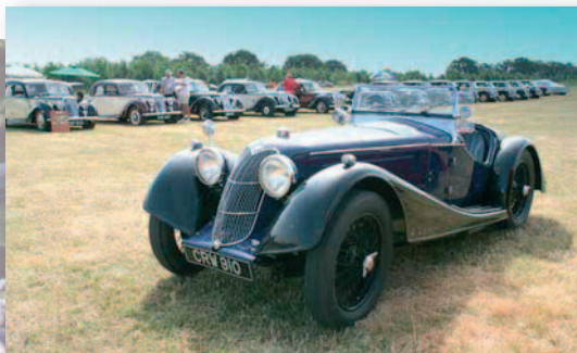
Riley Motor Club National Rally