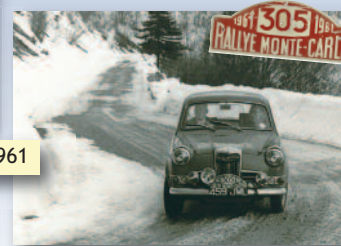
Monte Carlo Rally 1961