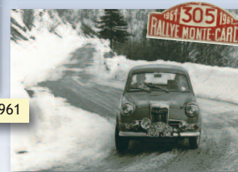
Monte Carlo Rally 1961