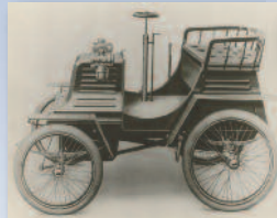
The first Riley car of 1898