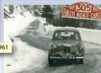
Monte Carlo Rally 1961