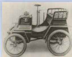
The first Riley car of 1898